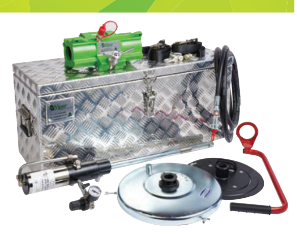
*Note Seals are sold separately